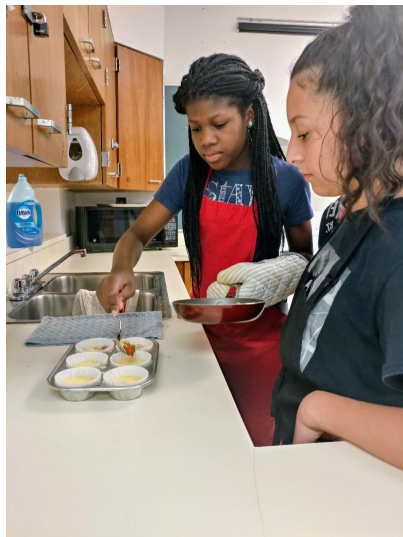
Howard County students are preparing baked omelets.

LTYC is excited to be collaborating with Elev8 again this summer to provide quality arts programming. Programs are held at 3 different sites including Collington Square Elementary/Middle, Gilmor Elementary and William Pinderhughes Elementary. Each site has programs in dance, culinary arts, martial arts and visual arts.