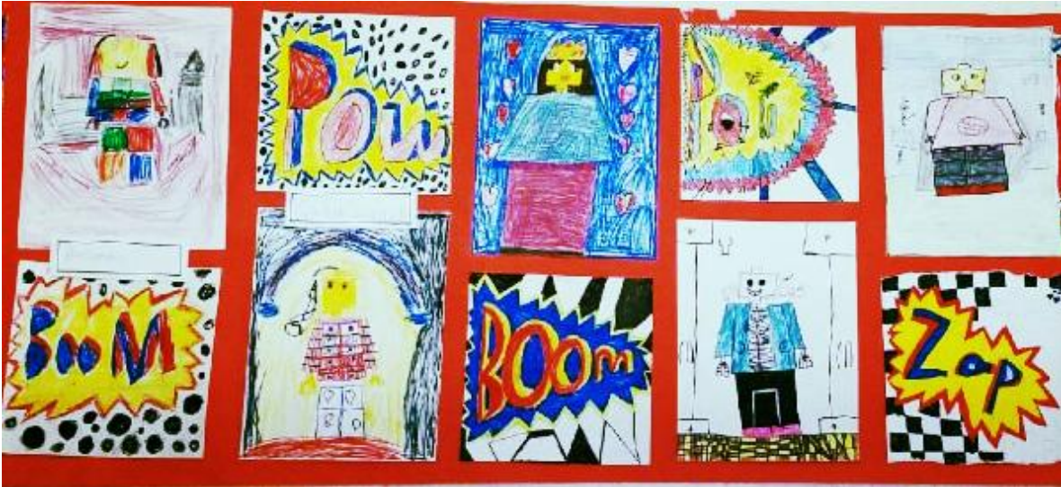
Featured Artwork by LTYC scholars of Franklin Square Elementary/Middle School

LTYC is off to a great start for the 2017-2018 school year! Check out some of the program highlights from the 1st and 2nd quarter!